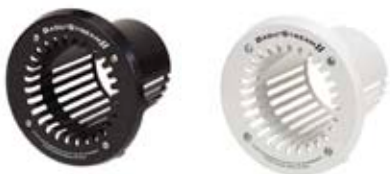
Optional round covers available in the colors black, gray, and white.

Consult your physician before attempting any strenuous exercise. This product may not be challenging or satisfying for all levels of exercise.